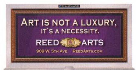
Examples of the billboard ads Reed Arts is using to increase its exposure to Columbus, Ohio, consumers